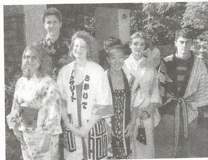
Former exchange students in traditional Japanese garb

In May of this year, we held our annual "Full Moon Blossom Festival," an enchanting evening of Japanese culture including taiko drum