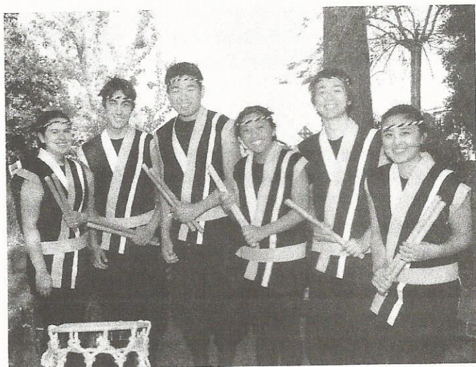
Taiko drummers of Raijin, from the University of California, Berkeley