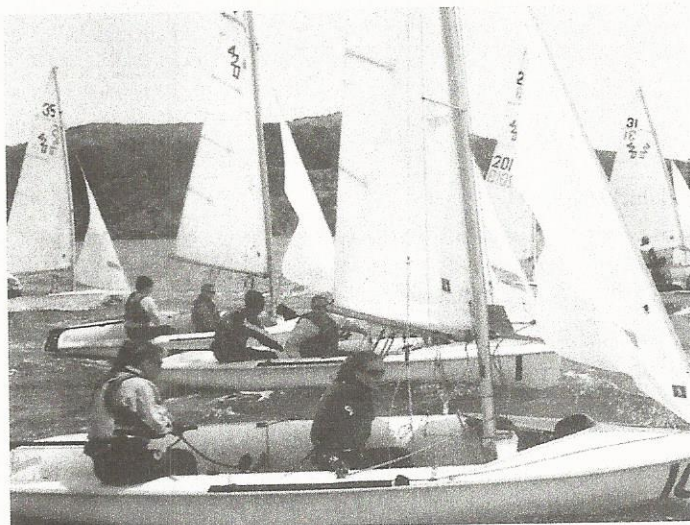
Youth Sailors at the Sausalito Yacht Club

Our Cascais sister city program also sponsors local cultural events, including Fado performances (traditional Portuguese folk music), a Portuguese film festival and art shows featuring Portuguese artists. In addition, we recently helped publish a bilingual children's book— Maria and the Lost Calf —which tells the tale of a Portuguese dairy farmer's daughter in the Marin Headlands at the turn of the century. The book has won several awards.