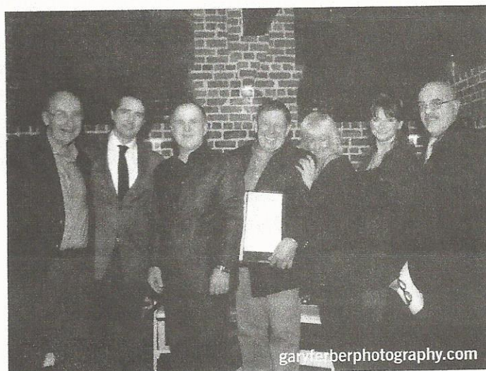
Fado Night at the Pines

Visit www.sausalitosistercities.org or the Sausalito Sister City Facebook page.