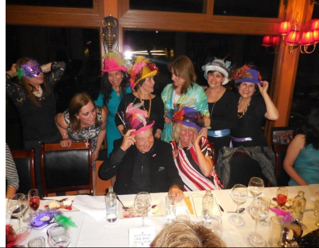
Final Evening and Fond Farewell